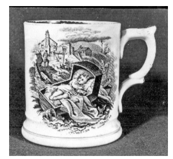
Commemorative mug produced following the Flood

According to reports following the event there were at least twenty-two victims of the Great Sheffield Flood of 1864 buried in Loxley Cemetery. There is likely to be more recorded in the burial records as a number of victims weren't immediately identified and may have been interred sometime later. For example, twelve members